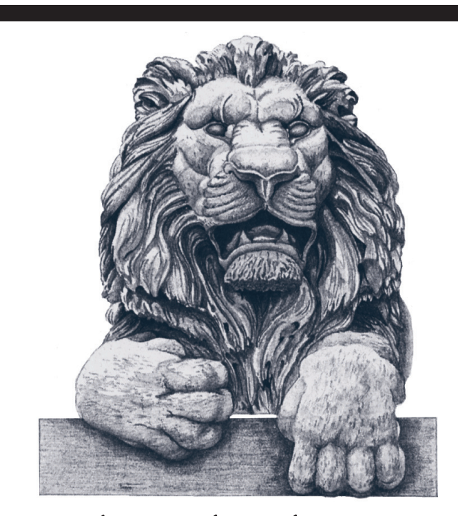
The Lynde and Harry BRADLEY FOUNDATION 2009 Annual Report